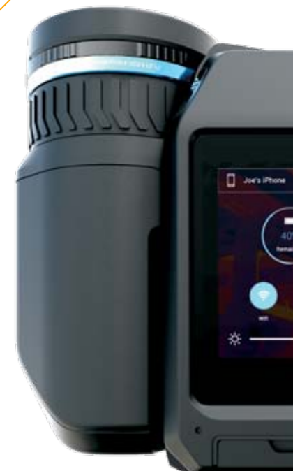
Image from any angle - easily and comfortably.